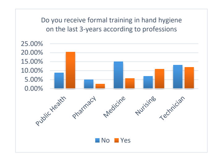
Figure 1. response regarding hand hygiene formal training in the last 3 years

Furthermore, (Figure 1) provides the distribution of participants based on profession and illustrates their response regarding hand hygiene formal training in the last 3 years. In total, (51.3%) said yes. As the figure shows, public health professional attended training on hand hygiene more than the other professions.