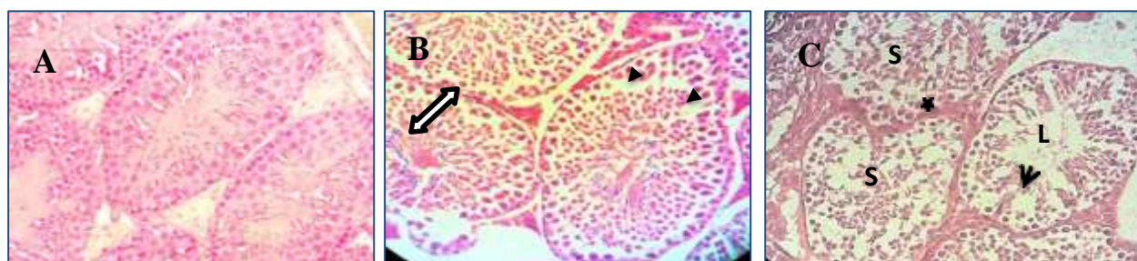
Figure 1. A photomicrograph of a testicular tissue from the control mice (A) showing the normal structure of seminiferous tubules and the interstitial spaces also appear normal. (B) a photomicrograph of a testicular tissue of 500 mg/kg CPFx treated mice showing disorganization of germinal epithelium in some seminiferous tubules (double head arrow) and loss of some spermatogenic cells (black triangle). (C) a photomicrograph of a testicular tissue of 750 mg/kg CPFx treated mice showing a thickness in basement membrane (star), sloughing of germ cells into tubular lumen (S), vacuoles (head arrow) and absent of sperm in lumen (L). (H & E 40 x)

The testicular tissues of control mice showed the presence of a normal testicular structure and regular seminiferous tubular morphology with normal spermatogenesis (Figure 1A). testicular tissues from the group exposed to 500 mg/kg of CPFx revealed loss of some spermatogenic cells and existence gaps between them as well as disorganization of germinal epithelium in some seminiferous tubules (Figure 1B). while 750 mg/kg treated mice demonstrated disorganized of spermatogenic epithelium, a thickness in basement membrane, sloughing of germinal epithelium, vacuolization of germ cells cytoplasm as well as absence of spermatozoa in the lumen of some seminiferous tubules (Figure 1C).