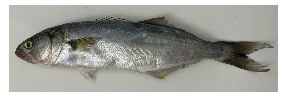
Plate 1. Morphology of Pomatomus saltatrix

The Bluefish, Pomatomus saltatrix is a member of the Perciforms, which belongs to the Pomatomidae; It is a commercial continental shelf fish that is worldwide distribution [1-3]. The morphological characteristics of P. saltatrix (Plate 1), are that its body is long and silvery in color on the dorsal side with a black spot at the base of the pectoral fin; The head is solid at the top and contains a large mouth with strong teeth; The two dorsal fins are close together, The pelvic fin is short and the anal fin consists of two spines [4].