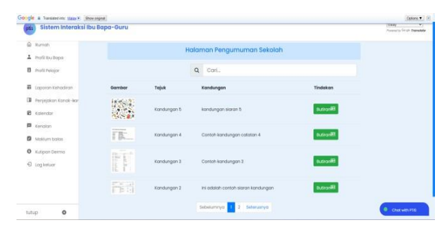
Figure 11. The interface of the School Announcement Page incorporates language support features

Figure 11 shows an interface of a function that helps parents who do not speak Malay language, the primary language of education. By adding language support to the PTIS website, the project addresses the language barrier issue. This function lets parents and teachers of different languages read school updates, announcements, and academic progress reports in their preferred language. This effort promotes inclusivity, accessibility, and effective engagement for all parents, regardless of language competency, creating a more supportive school community where all parents may actively participate in their child's education.