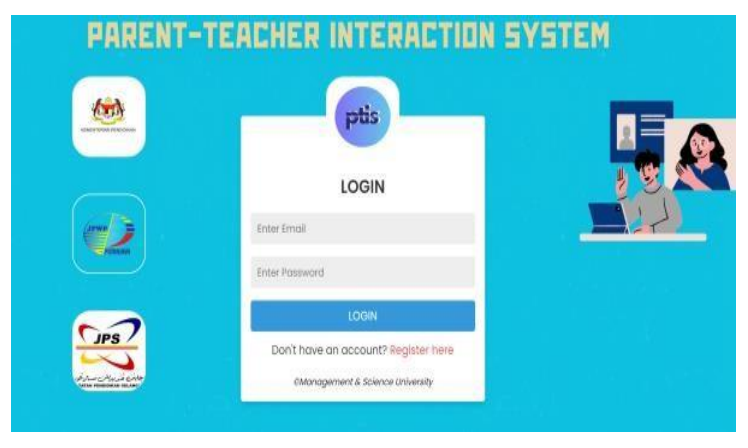
Figure 6. Interface of Login Page

Figure 6 shows the login page that registered users use to securely access the system by entering their email and password. The input fields accept user data, and validation checks verify it before submission. The server receives the credentials and verifies them against phpMyAdmin's user database after pressing "Login Now". The system gives access to valid users and displays error messages for authentication failures. Successful authentication generates a session that allows website navigation without re-entering login information. Users automatically access dashboard pages after logging in. Logging out deletes session data and redirects users to the login page. A login page is a safe and easy mechanism for users to verify their identity and access restricted content or services.