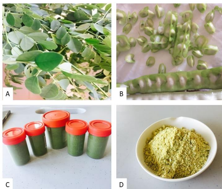
Figure 1. Fresh leaves (A), fresh seeds (B), dry leaves (C) and dry seeds (D) that used in the experiment.

Samples were collected from Ain Zara and Tajoura, Tripoli, Libya (Figure 1). The collected plant leaves or seeds were washed gently with water, drained as much as possible and finally fine spread over a wide filter paper and left in the shade at room temperature for two weeks.