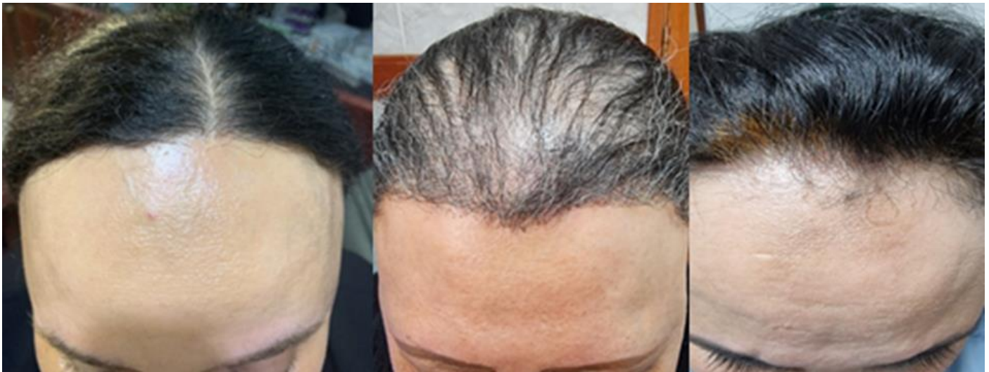
Figure 1. clinical types of FFA from left to right; linear type I, diffuse type II, pseudo-fringe type III.