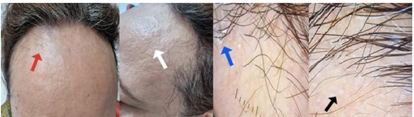
Figure 3. A 51-year- old female, picture shows pale and shiny skin with recession of anterior hair line and lonely hair; red arrow. Facial papules on temporal region; white arrow. Trichoscopic findings; perifollicular scales; blue arrow. White dots; black arrow.